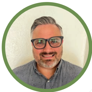
CHASE HILL CHURCH PLANTING CATALYST