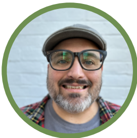
CHASE HILL CHURCH PLANTING CATALYST