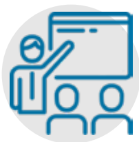
TESTED STRATEGIES IN YOUR CONTEXT