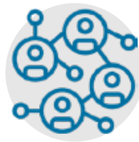
PRACTICAL TRAINING AND RESOURCES