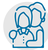
PASTOR RETIREMENT PLAN