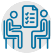
COACHING AND LEADERSHIP DEVELOPMENT

With Converge, you'll get personalized coaching, practical training, relevant resources and tested strategies that work in the community in which you plant. You'll be able to implement proven systems that will help increase the long-term success of your church plant. More importantly, you'll be part of a family with other experienced church planters and mentors to support you, enthusiastic partners who want to see you succeed.