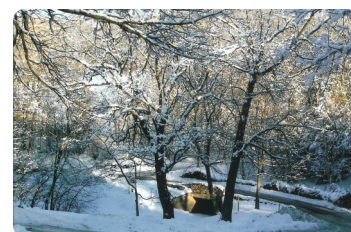
“Sharing God’s Heart in America’s Heartland”

16-17 Overseers Board Meeting Omaha, NE or online